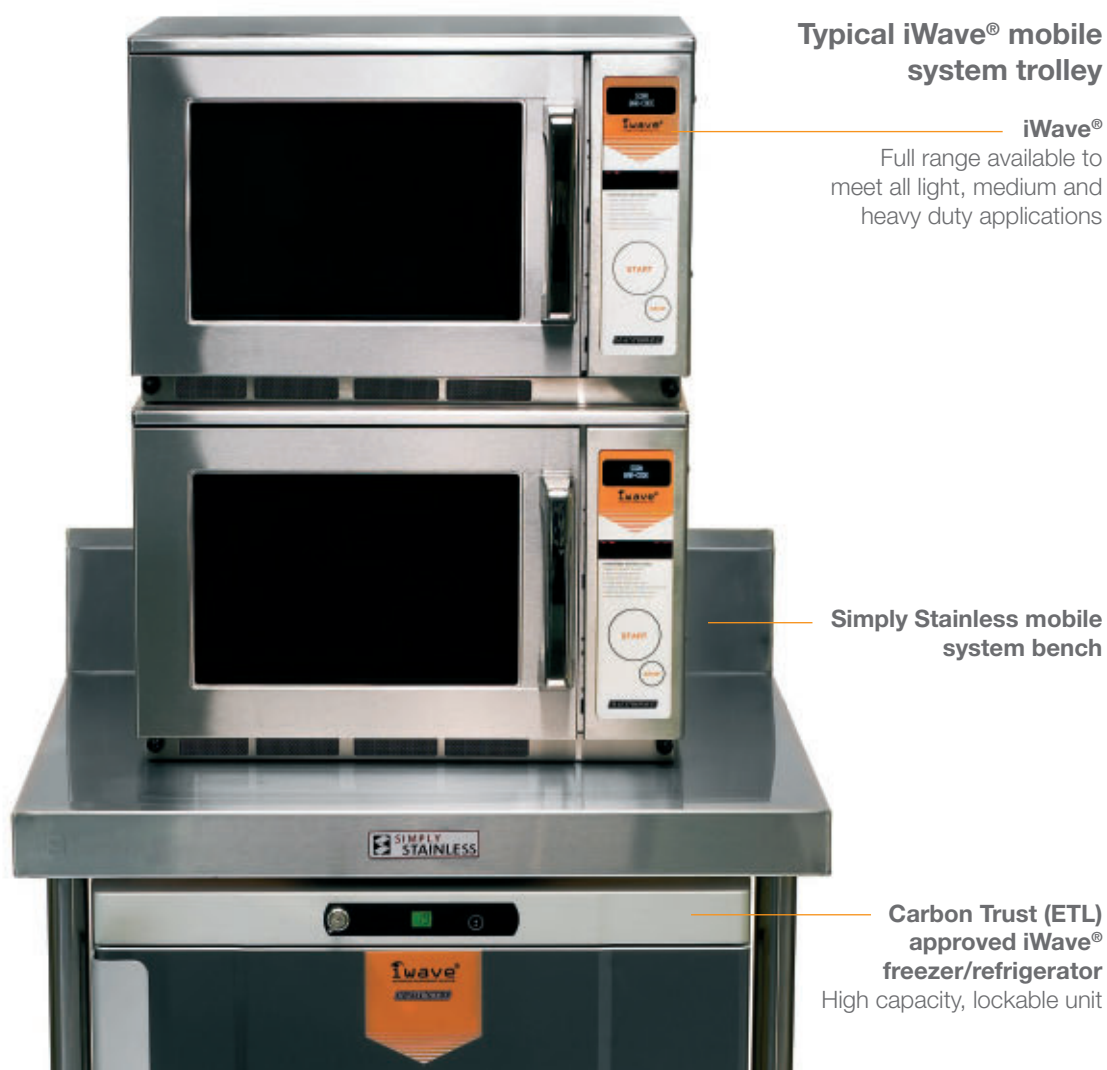
Typical iWave® mobile system trolley